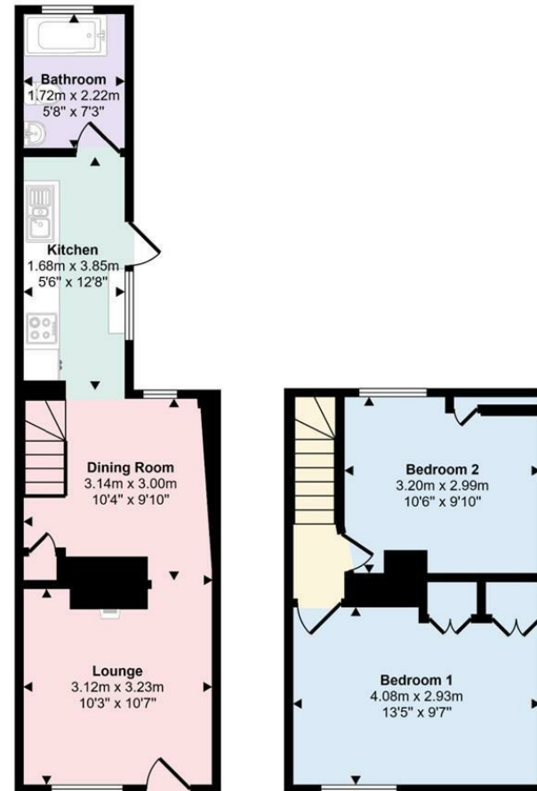
Ground Floor Approx 31 sq m / 333 sq ft

Guide Price £325,000 Tenure - Freehold Council Tax Band - C Local Authority - Uttlesford